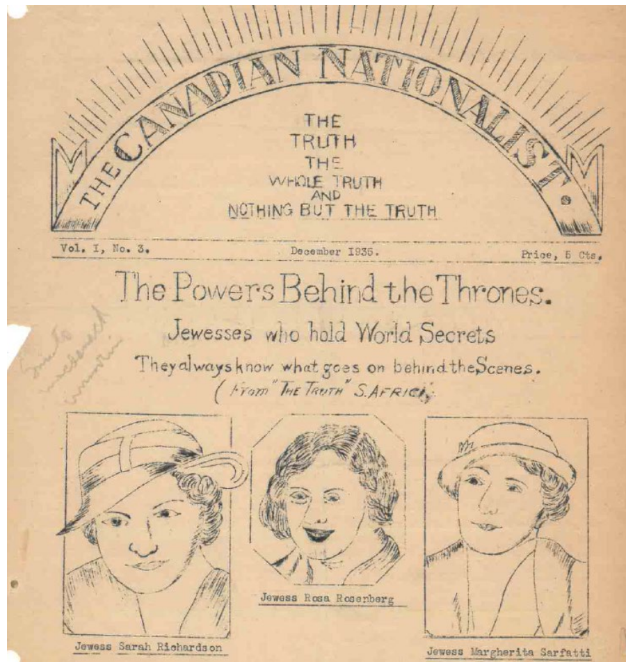
Canadian Nationalist (December 1935)

publication—in addition to its amateurish quality and increasingly bitter antisemitism—strongly suggests that it did not enjoy wide readership. 184